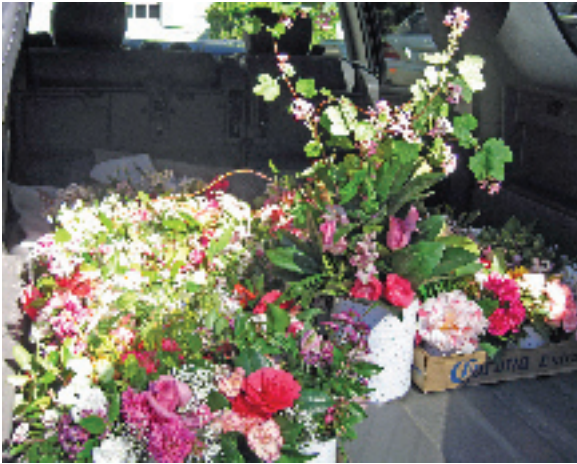
OGC Bouquets committee's beautiful floral arrangements on their way to the patients at the county hospital