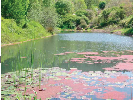
Pond at Quarryhill